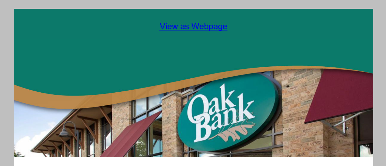
Top Ten Secure Computing Tips